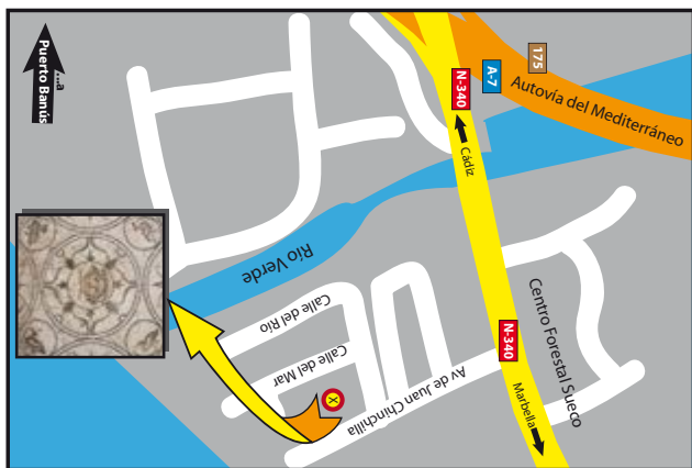
Roman Villa of Rio Verde