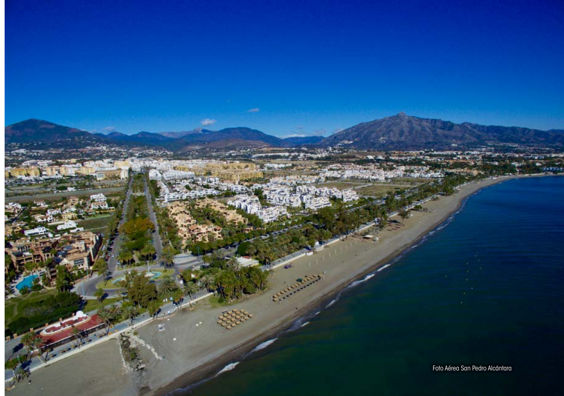
Foto Aérea San Pedro Alcántara