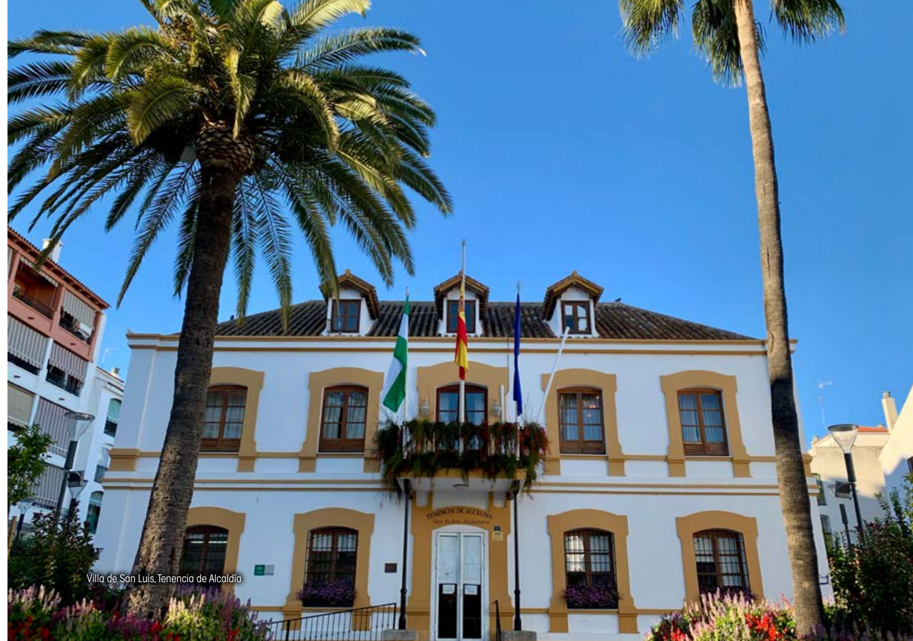
Villa de San Luis, Tenencia de Alcaldía