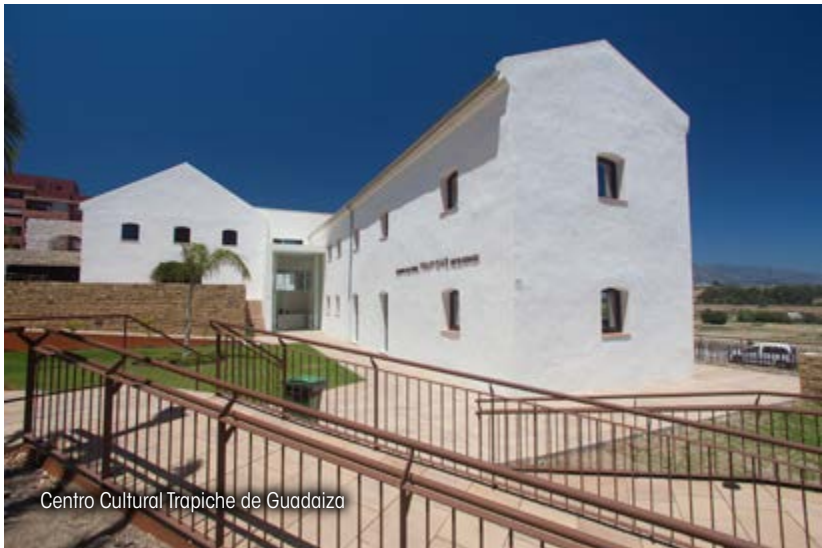
Centro Cultural Trapiche de Guadaíza