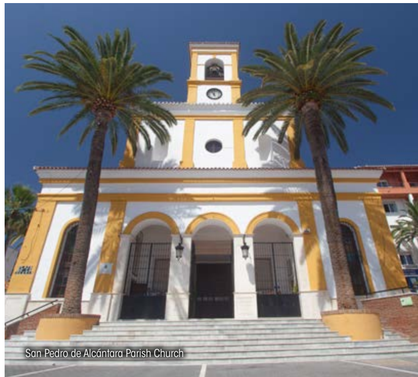
San Pedro de Alcántara Parish Church