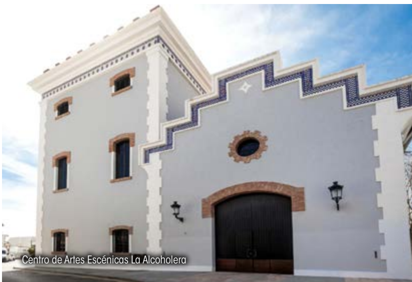
Centro de Artes Escénicas La Alcohola