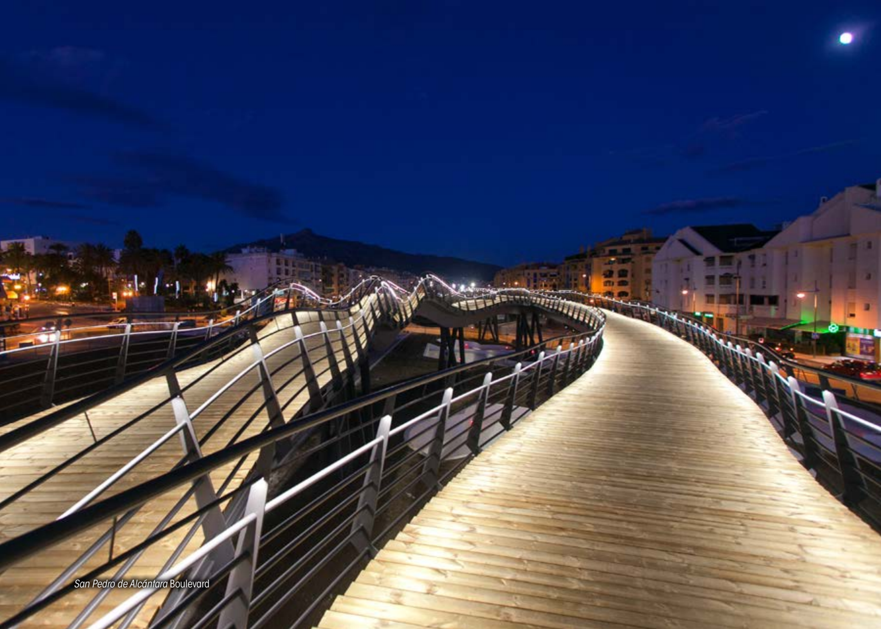
San Pedro de Alcántara Boulevard