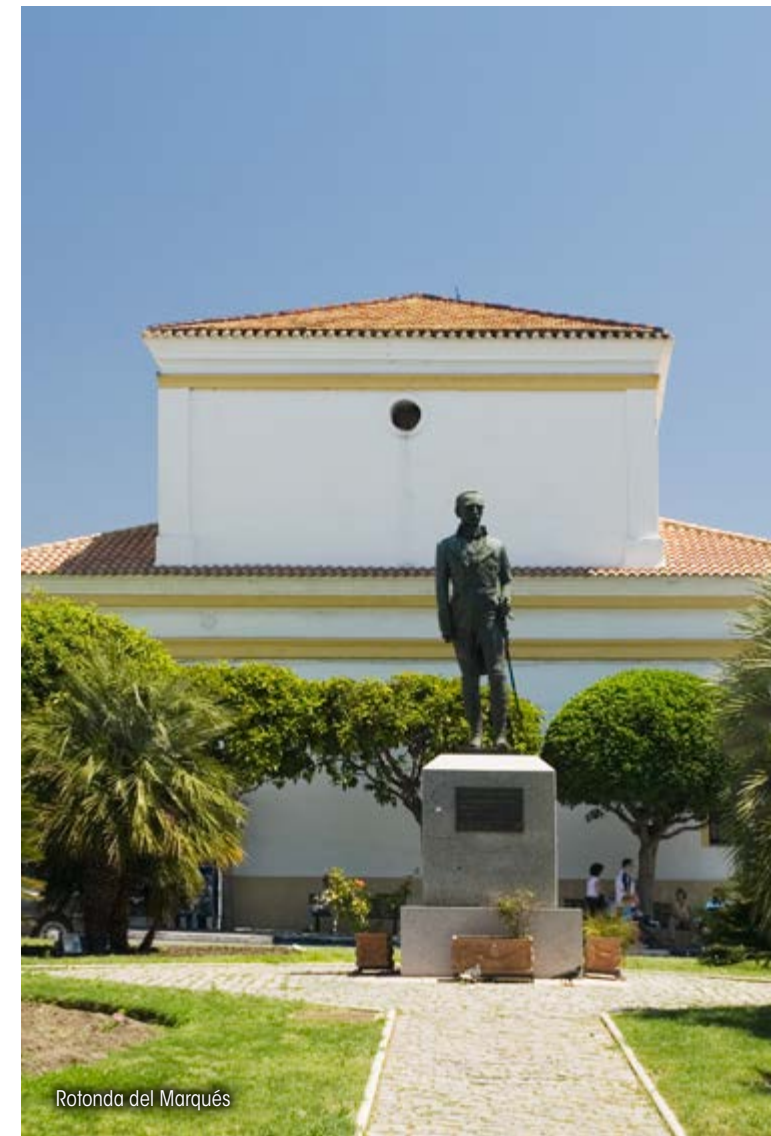
Rotonda del Marqués