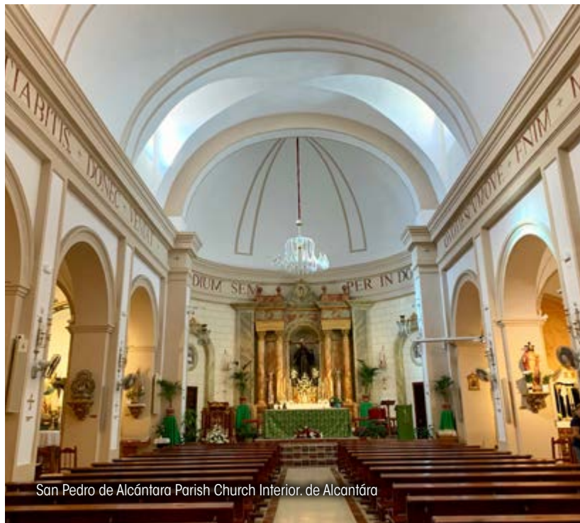
San Pedro de Alcántara Parish Church Interior. de Alcántara

The Villa de San Luis was built by the family who owned the colony after the Marquis of Duero at the end of 1880 but it was not until 1946 when it was acquired by the Marbella Town Hall and was used as a school, telephone switchboard and municipal office; over time it has become the administrative headquarters of the district of San Pedro Alcántara .